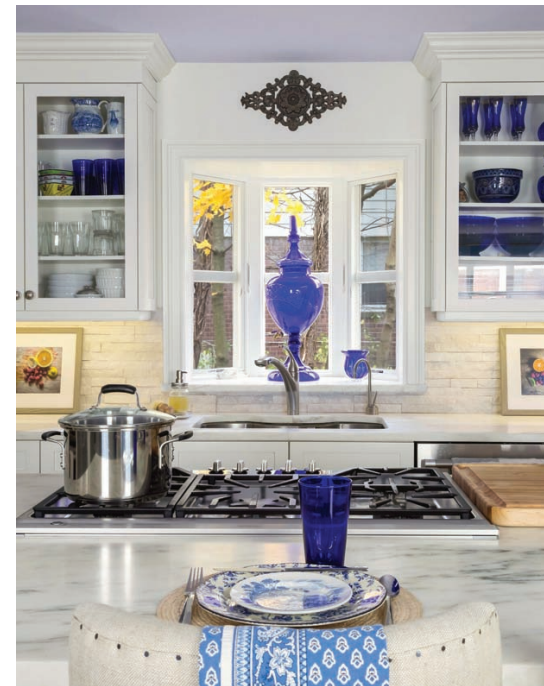
No need for a ventilation hood with a Thermador down draft cook top stove.